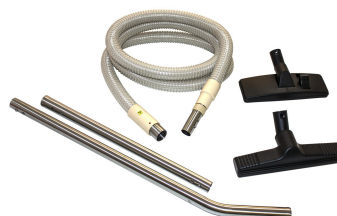
MV-1CR Tools and Accessories - Optional