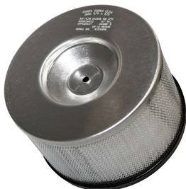
ULPA filter for MV-1CR (HH-CC) - individually laser tested